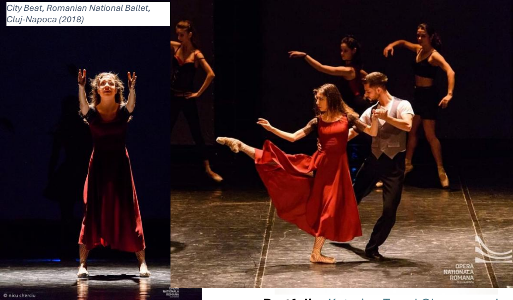
City Beat, Romanian National Ballet, Cluj-Napoca (2018)