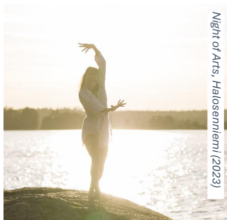
Showreel of previous artistic work: